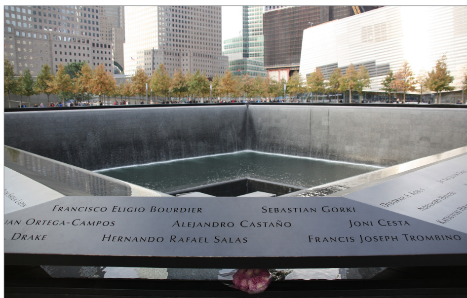
Figure 2: National September 11 Memorial, Arad and Walker (2011), World Trade Center, New York.

In Berlin, in particular, significant questions arise as to the relative importance and suffering of various victim groups, and about victims and events that remain