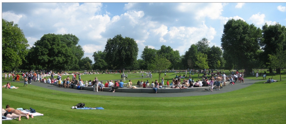
Figure 1: Diana, Princess of Wales Memorial Fountain, Gustafson and Porter (2005), Hyde Park, London.

In recent decades, the number and physical scale of public memorials to victims have increased significantly. Memorials are proposed to victims of unexpected