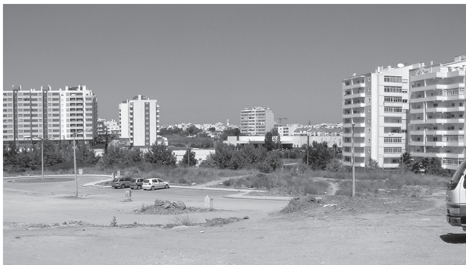
Figure 2: Remaining space in Portimão, a mid-sized Portuguese city.

The urban interstices located among natural tensions – social, economical, spatial and temporal – are seen as problematic, especially in the peripheries, mainly because of their lack of functionality, typology and an attributed name. However, these spaces of urban articulation might be fundamental to the future of our cities. According to Careri (2002), they constitute a complex system of public spaces that can be crossed without any need for borders. They also represent the last place where it is possible to get lost within the city, where we can feel beyond surveillance