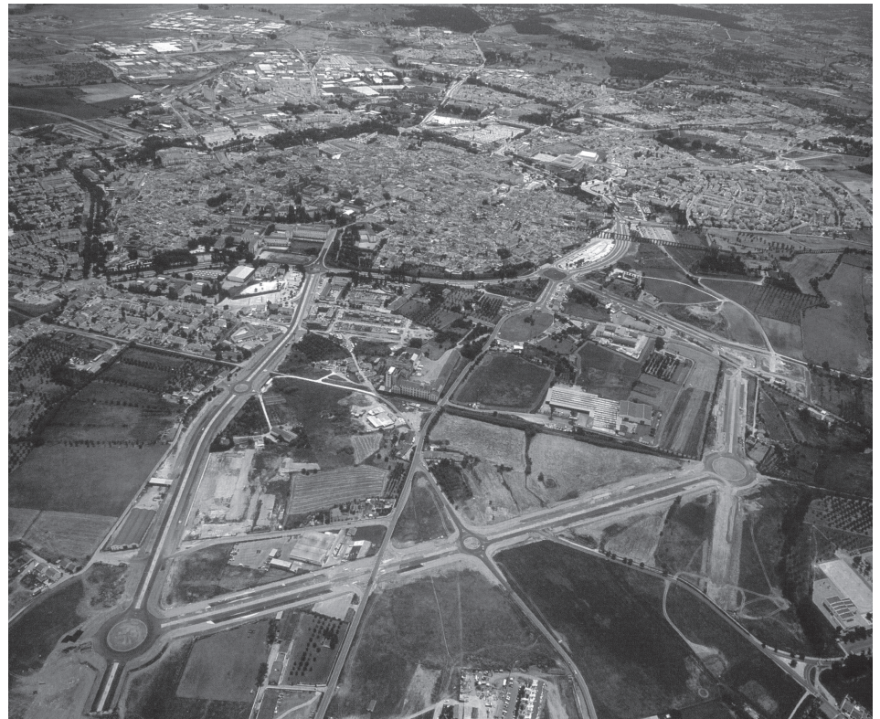
Figure 1: Aerial view of Évora, a mid-sized Portuguese city, in 2006, showing the vast interstitial spaces caused by the recent city expansion (Domingues (2006), p 31).

These spaces were called 'urban voids', 'interstitial spaces', 'empty spaces', 'land-between', 'brownfields', 'in-between' and ' terrains vagues ', among other things. 'Urban voids' seems to be the most common definition for this kind of space.