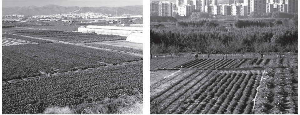
Figure 6: Baix Llobregat Park. The extension of the agricultural park in the urban space of Barcelona (left) and the proximity of the agricultural park to the built fabric of Barcelona (right) ( http://www.diba.cat/parcsn/parcs/galeria.asp?parc=9&m=189&s=1074 ).