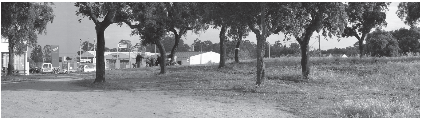
Figure 3: The elderly meeting in the late afternoon in a residual space in Évora, an example of temporary use of an interstitial void.

Corner's proposal to the Lisbon Architecture Triennale (Figure 4), 'TOPO-Life: Building a new eco-civic infrastructure on Lisbon's topography', may be considered an example. This new landscape project reflects the local topography, ecological systems and social/civic adjacencies linking two riverfronts (the Tagus River and the Trancão River). Surrounding the airport area, the new project is a productive,