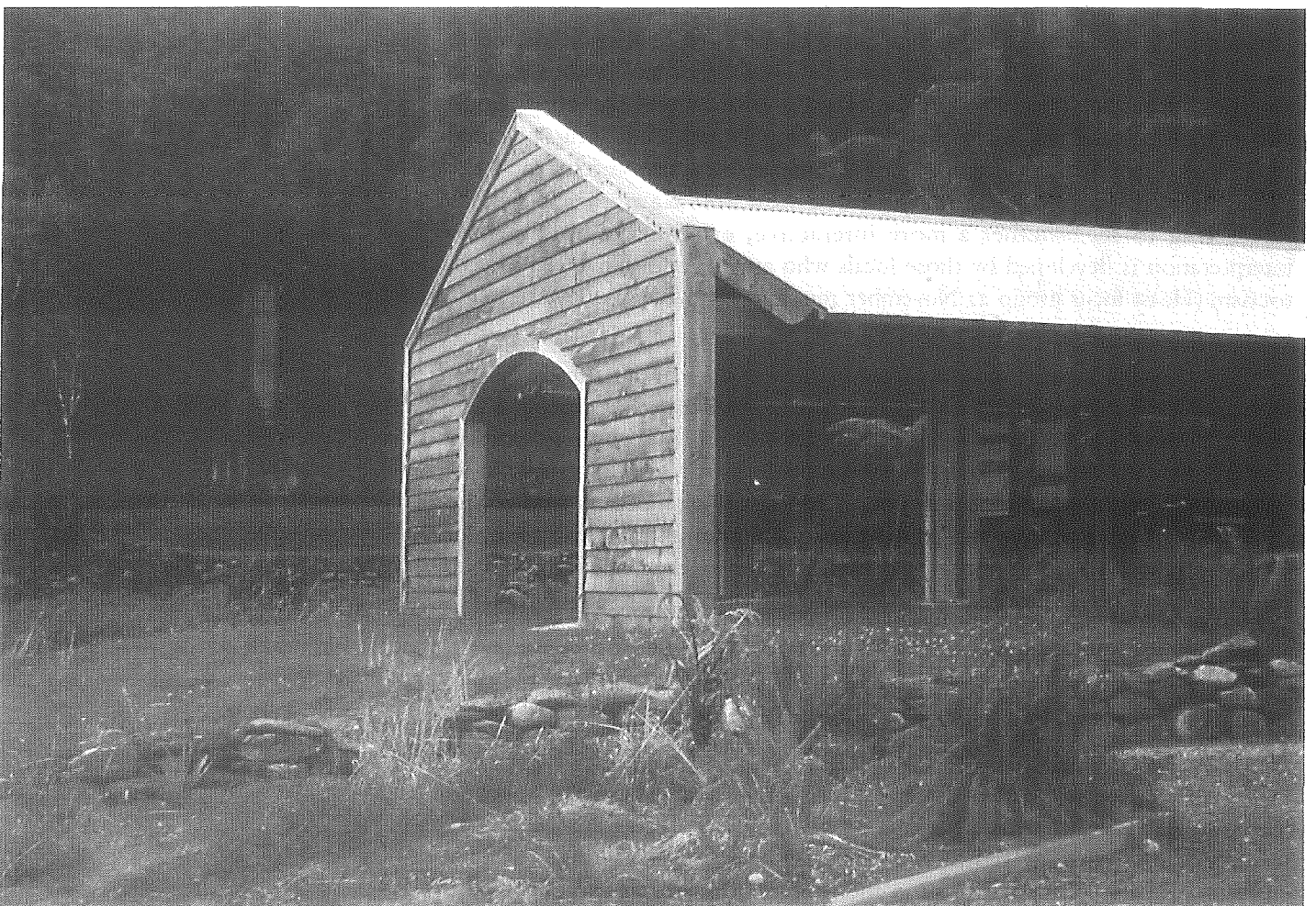
Figure 3: Elegantly sited and evocatively representing hints of old boat shed, the information shelter at Jackson Bay (architect Peter Kent) is self conscious rather than integrated into its setting

My conclusions relate directly to the opening questions concerning the possibility of defining different versions of heritage, the impact that these versions may have had on policies and strategies for managing the world