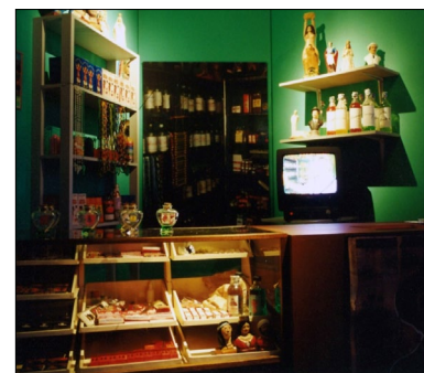
Figure 1: To the left are smell samples, allowing visitors to experience odours in this replica of an esoteric shop (Botánica) shown in the Easter in Carúpano Venezuela exhibition (Semana Santa en Carúpano, Venezuela – pääsiäinen Carupanossa Venezuelassa) held from April–June 2000 at the Helinä Rautavaara Museum in Espoo, Finland.

In his landmark publication, The Visual and Spatial Structure of Landscapes , Tadaheko Higuchi (1983) outlines eight indices of visual perception of the landscape that can be assessed using GIS. Considering the differences in spatial structure of other sense experiences, we contend that his work can provide a