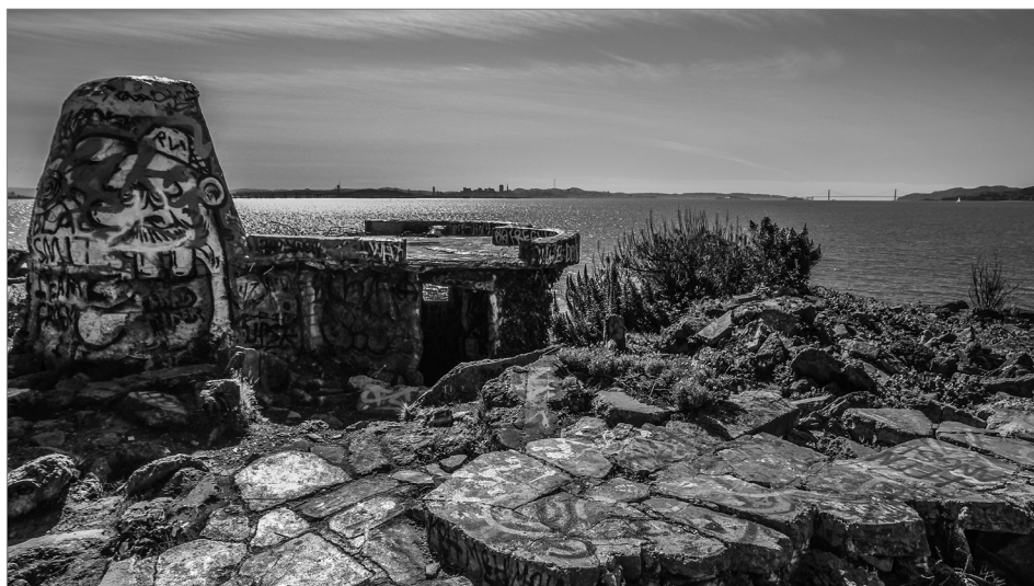
Figure 4: The castle ruins at the western edge of the Albany Bulb, with San Francisco, the Golden Gate and Marin Headlands visible across San Francisco Bay, 2013. (Photo: Author's own.)

path networks (figure 5). This untamed circumstance of slow decline resulted from a combination of reticent legal custodianship due to unsafe conditions on the Bulb, the deadlocked ambitions of opposing vested interest groups, and community activism to save the Bulb from being rationalised into open sports fields, parking lots and boat-launching facilities.