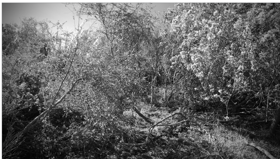
Figure 10: Immersive thicket in the inland area of the Albany Bulb, 2013.

of navigation that is contingent on distant goals. However, conceiving of navigation in this Kantian manner – in which the world is oriented and comprehended in relation to the sides of the body – perpetuates the conception of the space in between the walker and their goal as inert and without qualities or differences (Kant, 1929). Rather, following Heidegger (1962), the body-based axial directions are not projected onto a neutral and directionless Cartesian space. Instead, the environment is innately conferred with qualitative clues to orientation that operate in communication with the body's referenced sense of direction. The resultant orientation emerges from an amalgamation of the body and the finely textured features of its proximate landscape. For Gilles Deleuze and Felix Guattari (1987), this body-based and landscape-oriented relationship is manifest most acutely in motion so that a walker negotiates the apparent limitlessness of immersive space through the continual discovery and rediscovery of an appropriate direction. This tactical and immediate form of navigation orients the walker in many little ways within a general disorientation.