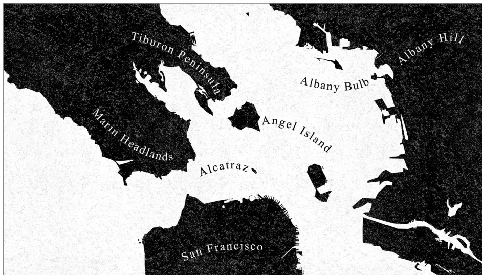
Figure 2: Albany Bulb in the context of San Francisco Bay.

subsurface profiles are a complex patchwork of garden waste, rock, brick, concrete, asphalt, rebar, wire, metal, plastic, timber, rubber, clay and slag (CRWQCB, 1982).