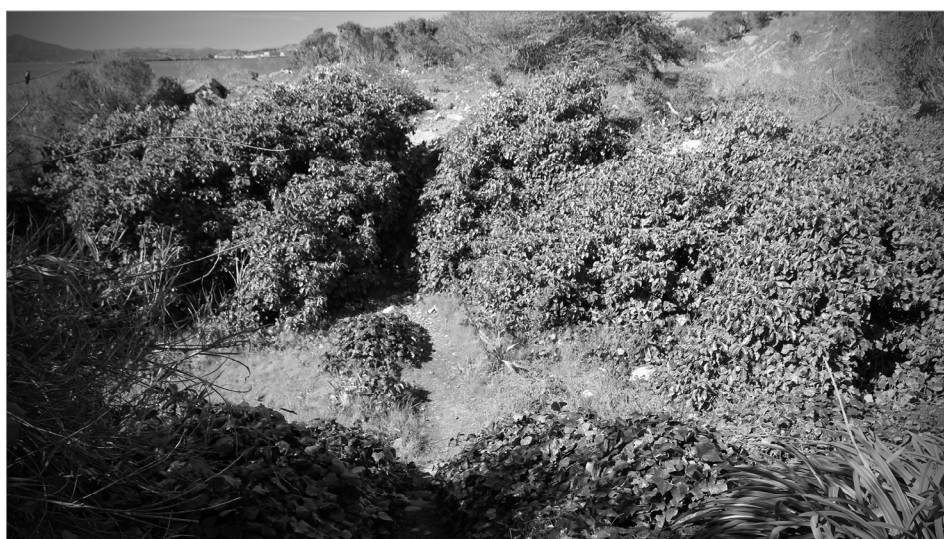
Figure 8: Deformed hollow topography in the inland area of the Albany Bulb, 2013.

Over the four decades since landfilling activity ended, uneven subsidence has deformed the plateau from a smoothly graded surface to an amorphous topography riddled with depressions (figure 8). The porous nature of the uncompacted substratum supported this deformation, permitting rainfall to percolate directly down without running off and merging with the rivulets and streams that are typical of the Bay Area. In these more common landscapes, the converging structure of waterlines imbues the terrain with innate legibility and orientation, so that through its linearity and flow a river acts as a natural ‘catching’ feature when approached from side-on, and as navigational thread when followed alongside. From a navigational point of view, tracking a linear waterway is similar to following a clear path in that it is simple to establish and