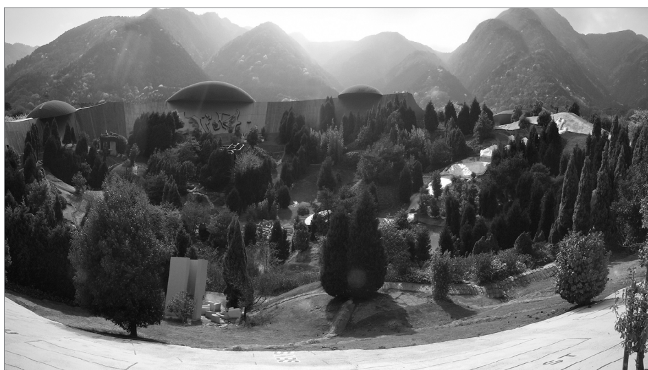
Figure 11: Fabricated complexity at the Site of Reversible Destiny, Yoro, Japan, 2008.

Tree City falls within a longer legacy of contemporary landscape design, which is to inadvertently invoke the mundane or kitsch when attempting to manufacture complexity and openness. In some instances, however, this process is shown to be successfully accelerated by heavily articulating initial conditions where few or none existed formerly. The Site of Reversible Destiny in the Gifu prefecture of Japan is one such project, exuding sensory roughness and navigational complexity on a formerly grassed area of town parklands (figure 11). 6 In this instance, the artists Arakawa and Gins (1997) exploit the overtures of the project by ambiguously positioning it between the theme park, interactive sculpture, and garden. As a continuation of the artists’ explorations into rewiring perceptual assumptions, the deformed topography acts as a kind of training ground for recalibrating visitors’ proprioception and orientation.