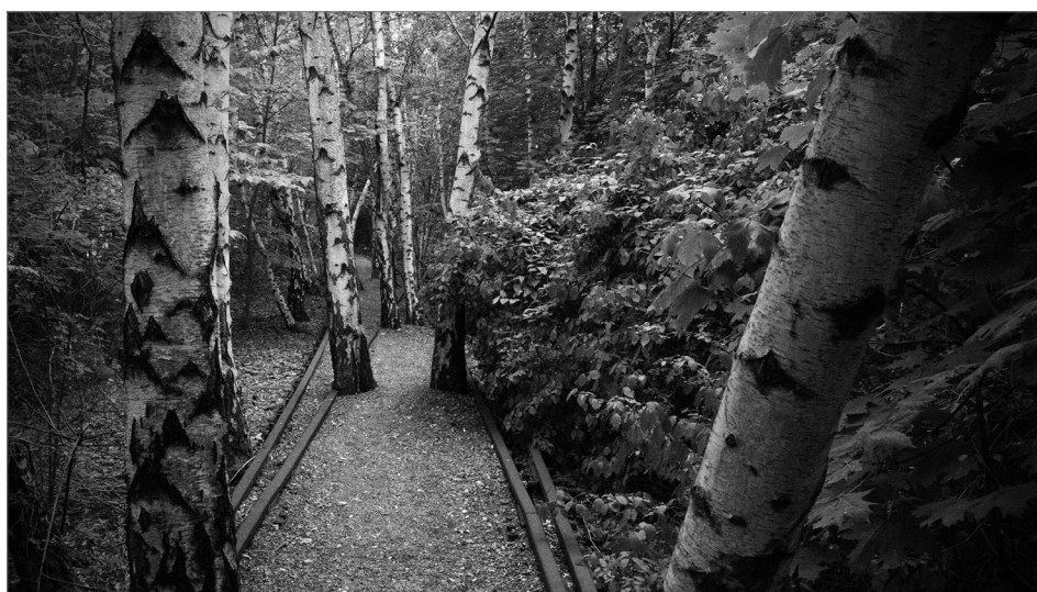
Figure 1: Gravel path between overgrown railway tracks, Nature Park Schöneberger Südgelände, Berlin-Tempelhof, Germany, 2014.

The fraught relationship between design and wastelands results from the core mandate of design to create the utility that distinguishes it from artistry (see Vartan, 2013). Moreover, an underperforming site is vulnerable to general social sensitivity about decline and narrow economic definitions of appropriate