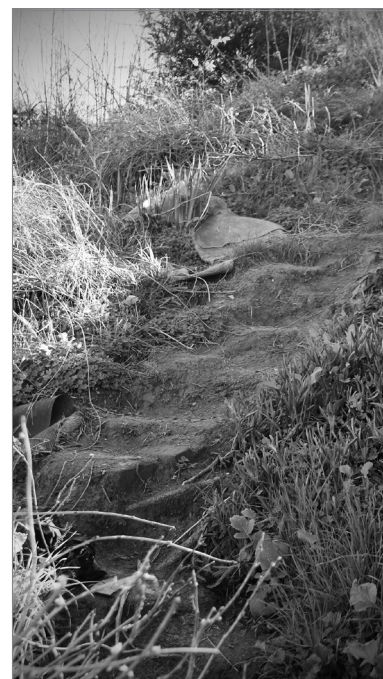
Figure 9: Steps worn into a hillside by feet on the north-eastern edge of the Albany Bulb, 2012.

That the walker re-establishes temporary orientations on seeing a flickering light or fragmentary distant view implies a self-referential and vector-based form