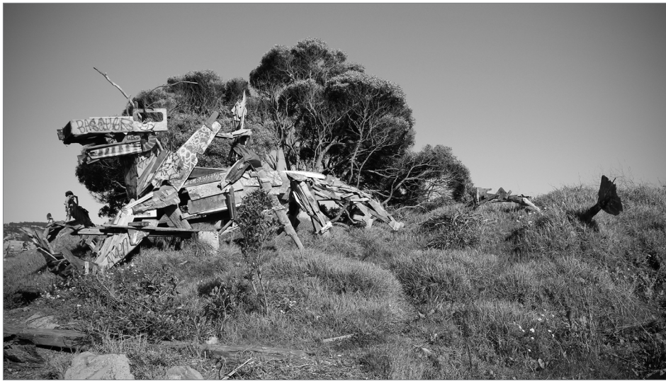
Figure 5: Sculpture made from found objects situated in the north-western area of the Albany Bulb, 2012.