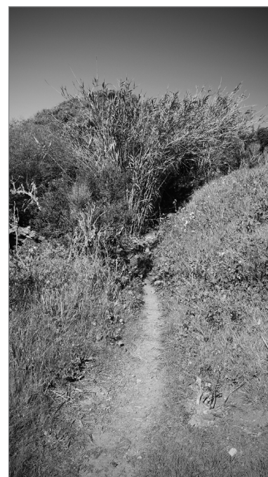
Figure 7: Trail diminishing in width situated in the western area of the Albany Bulb, 2013.

Conversely, overcoming negative risk/reward assessments and continuing along a diminishing path in the face of these doubts can lead to unanticipated revelations. The Albany Bulb path network is full of such instances, whereby the narrowing of a path may be interpreted as a filter that edits out those who are not yet ready to make a particular discovery. Those who are ready – perhaps on the second or third visit – are often privy to significant disclosures that include discovering the concrete castle, the tent library or a ragged precipice. Conversely, many similar paths are just as likely to lead to rubbish piles, bush toilets or dead-ends as they are to find revelatory vistas. The navigational outcomes are therefore unpredictably variable and contrast with the automation of the circuit path. When compounded with the difficult terrain and obfuscated lines-of-sight that challenge bodily alignment, the conditions for detached mind-from-body thinking that are associated with the level loop path are absent. Rather, as the artists Arakawa and Madeline Gins (1979, 1997) explore extensively, the experience of movement in the physical world becomes integral to the walker's thought-path.