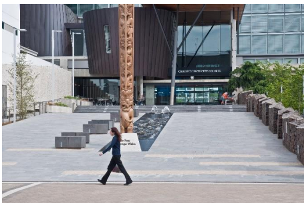
Figure 2 The Christchurch City Council Civic Offices are part of the substantial Ngai Tahu Property Portfolio totalling $600m (Phillip, 2010)

to tribes that settled later in the Treaty claims process.