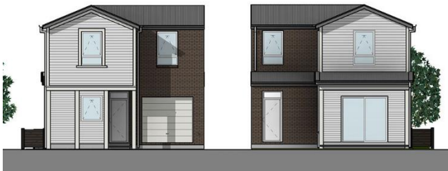
Figure 3. Artist Impression of a 3 bedroom house in the Waimahia development (Waimahia Inlet Limited Partnership, 2014)

At Wigram Skies, a new 3 bedroom two storied townhouse on 183 m 2 is currently on the market (figure 5) for approximately $529,000 (Lewis, 2014) - showing that affordability is not the main goal in mind.