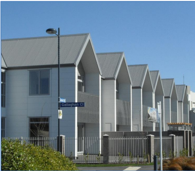
Figure 5. An image of the three bedroom townhouses for sale at Wigram Skies for over $500,000 which can be compared with the Waimahia option above for substantially less. As one can see these townhouses have connecting walls to other homes (Ruske, 2014).