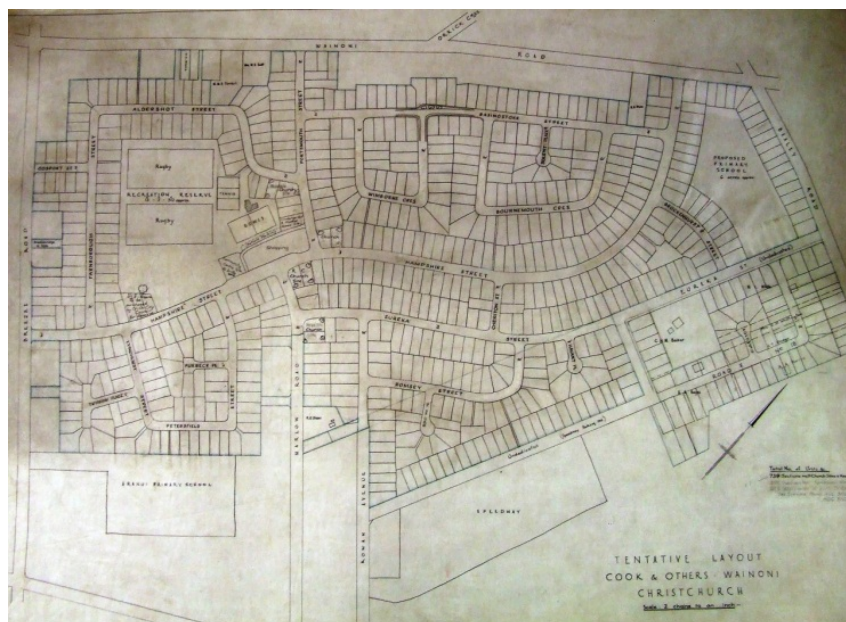
Figure 1: Tentative Layout, Cook and others, Wainoni Christchurch 1955.

In the main development, the Wainoni Block, at least twenty brand new streets appeared on the first maps that emerged during early 1950s and in the first sketches they would merely have been labelled numerically by engineers and draughtsmen. One of the earliest plans from 1955 shows a proposed layout and some provisional names (see Figure 1). It is certain that these names and the ones mentioned above were fixed by mid-1955 as a small article on new streets in the city that appeared on page 5 of The Press of June 28 th listed all of the names shown here.