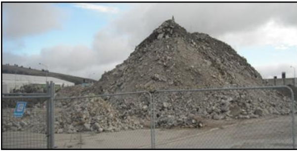
The remains of the 'Waters Edge' Apartments following demolition.

resource consents had been lodged with the Christchurch City Council.