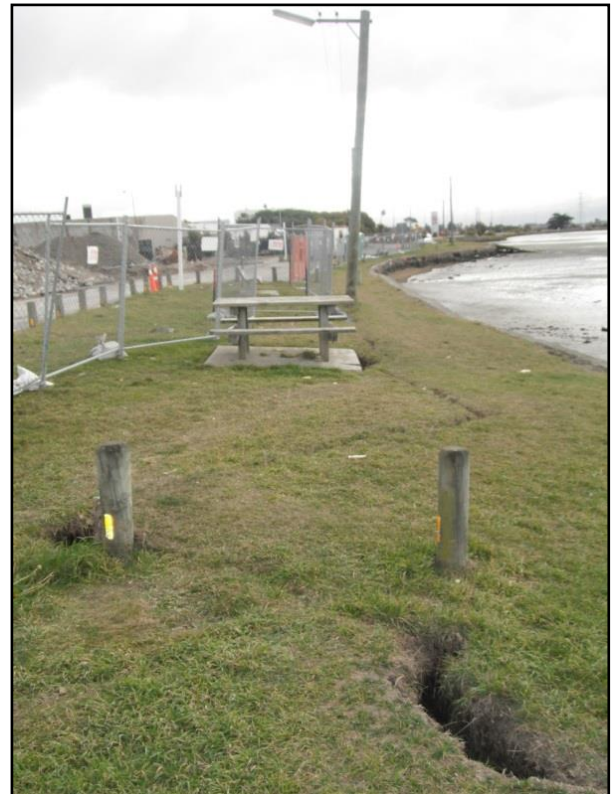
Significant lateral spreading on Tidal View

can be guaranteed to occur in the future. Hence we need to ask whether we design buildings, so that they can endure numerous earthquakes (post-quake serviceability (Smith, 2011)) or whether they are designed so that like Water's Edge, they are beyond repair but perform in such a way that no loss of life is endured and that they will not collapse. When it is the human race verse Mother Nature it is possible that we ought to design so that although uneconomic no loss of life occurs.