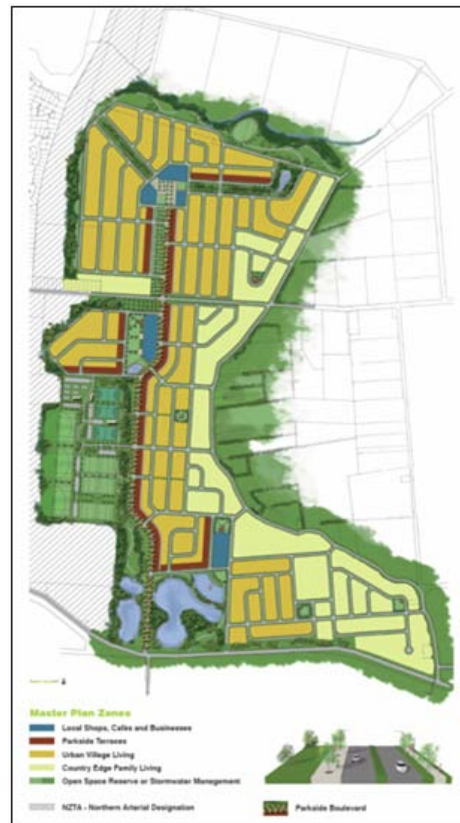
Figure 1: Highfield Park Master Plan

It has been confirmed that there is enough potential land for development in Christchurch to provide up to 6,000 homes (Christchurch City Council, 2011) and Highfield Park, would account for 2,400 of this. The developers are optimistic and are expecting the first packages to be available within the next 12 – 18 months (Highfield Park, 2011). The Highfield Park plan (Figure 1) will include a diverse range of housing, and offer a variety of living options that are designed to cater for different market requirements. The design includes a mixture of housing densities, a retirement village, open space, including central reserve with a swale and ponds to manage storm water, and four commercial areas including shops, cafes or childcare centres (Highfield Park, 2011). Prices would start from $275, 000 to $1,000,000 plus.