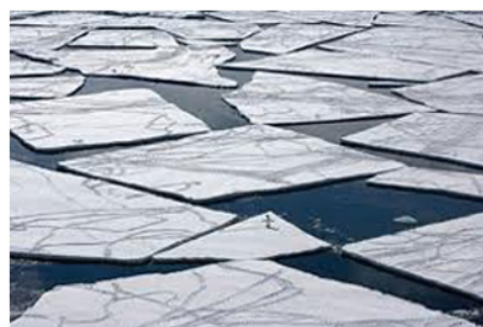
Figure 1: The unique environment of the Ross Sea.