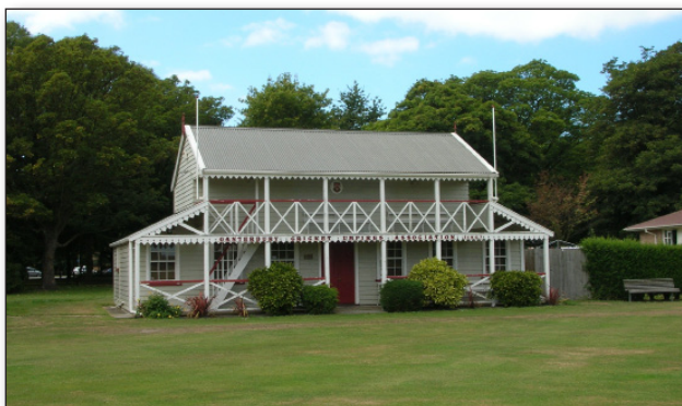
The historic Canterbury Cricket Umpires Pavilion on Hagley Oval – built in 1864 it is believed to be the oldest remaining sports building in New Zealand.