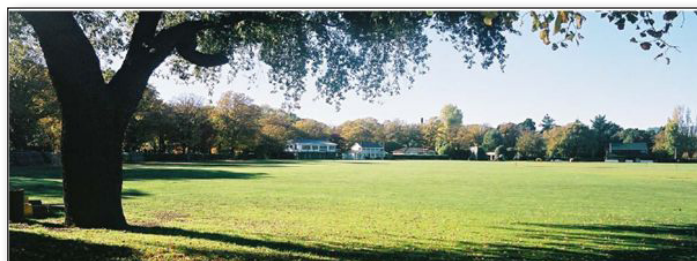
Hagley Oval.