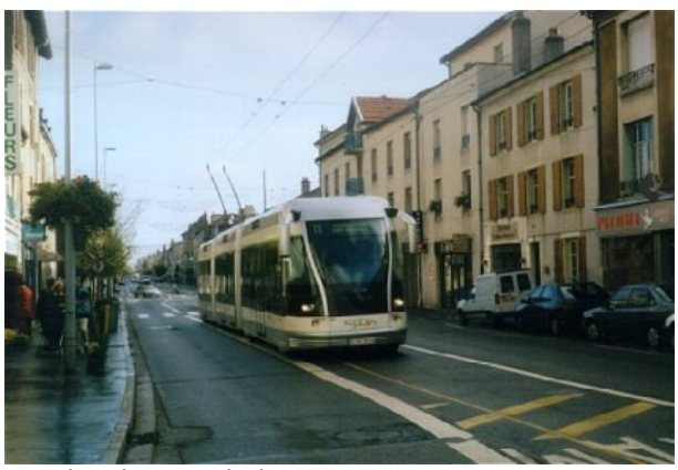
Bombardier Guided Bus System, Nancy, France

certainly not ideal; car pooling may need more encouragement, or trialling more free buses in times of low frequency to increase patronage and to reduce the energy demand should be considered.